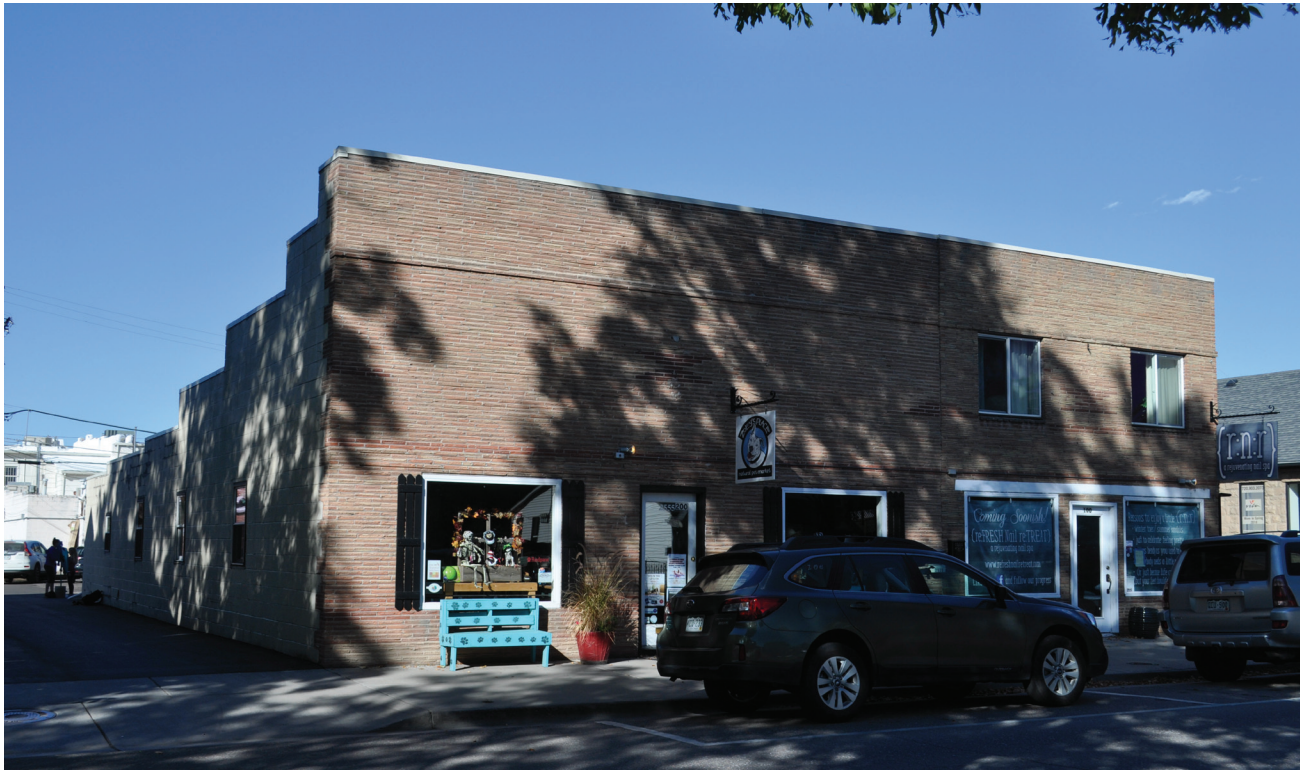
Photo: 2555 WAA 02.jpg South Wall, facade (left); East Wall (left), W Alamo Ave in foreground.